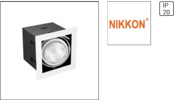
NIKKON MA SPOT HEAD SERIES S17106 + S17121 c/w PAR30 10D 70W/830 Lamp

S17106 + S17121 M0070 PAR30 10D MA SPOT HEAD SERIES NIKKON