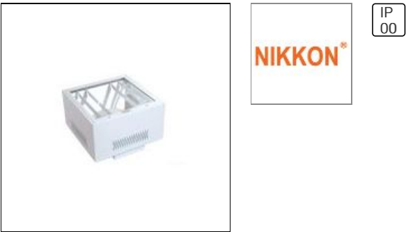
NIKKON NL400 SMS H0400 Lowbay c/w HPMV 400W Bulb Lamp

H0400 HPMV 400W BULB LAMP NL400SMS NIKKON