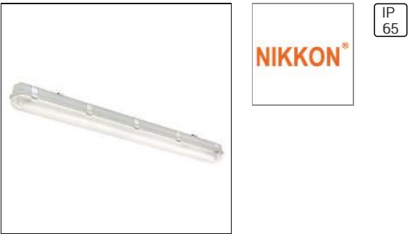
NIKKON N118 T8 IP65 Weather Proof Fitting c/w 18W Fluorescent Lamp

T8 IP65 WEATHER PROOF FITTING N118 NIKKON