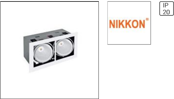
NIKKON MA S17109 ARGENTO 2x13W LED COB MODULAR Downlight (3000K)

2 X13W LED COB MODULAR DOWNLIGHT (3000K) MA S17109 ARGENTO NIKKON