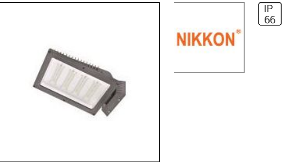
NIKKON S2266 LEDXION K10119 140W LED Floodlight (MB51) Type 3 (5000K)

140W LED FLOODLIGHT (MB51) TYPE 3 (5000K) S2266 LEDXION K10119 NIKKON