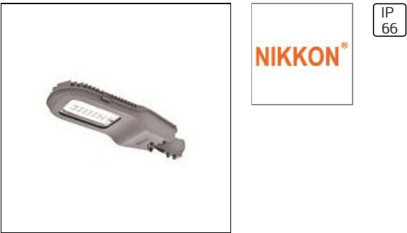
NIKKON S439 LEDXION SOLAR POWERED SLD SERIES 30W LED Street Lantern (3000K)

30W LED STREET LANTERN (3000K) S439 LEDXION SOLAR POWERED SLD SERIES NIKKON