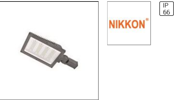
NIKKON LEDXION K10119 140W LED Floodlight (MB51) Type 2 (3000K)

140W LED FLOODLIGHT (MB51) TYPE 2 (3000K) S2266 LEDXION K10119 NIKKON