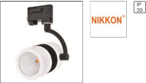
NIKKON ARGENTO K20100 13W LED Cylinder Track Light 85 (3000K)

13W LED CYLINDER TRACK LIGHT 85 (3000K) ARGENTO K20100 NIKKON