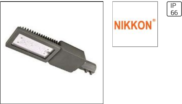
NIKKON S431 LEDXION SOLAR POWERED 21W LED Street Lantern DIMMING SYSTEM (5000K)

21W LED STREET LANTERN DIMMING SYSTEM (5000K) S431 LEDXION SOLAR POWERED NIKKON