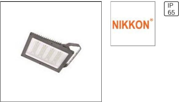
NIKKON S2266 LEDXION K10119 140W LED Floodlight (NB19) Type 4 (3000K)

140W LED FLOODLIGHT (NB19) TYPE 4 (3000K) S2266 LEDXION K10119 NIKKON