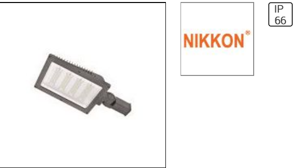
NIKKON S2266 LEDXION K10119 230W LED Floodlight (MB51) Type 2 (3000K)

230W LED FLOODLIGHT (MB51) TYPE 2 (3000K) S2266 LEDXION K10119 NIKKON