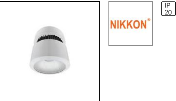
NIKKON BRONZO K01130 27.8W LED AC Cube Surface Downlight (3000K)

27.8W LED AC CUBE SURFACE DOWNLIGHT (3000K) BRONZO K01130 NIKKON