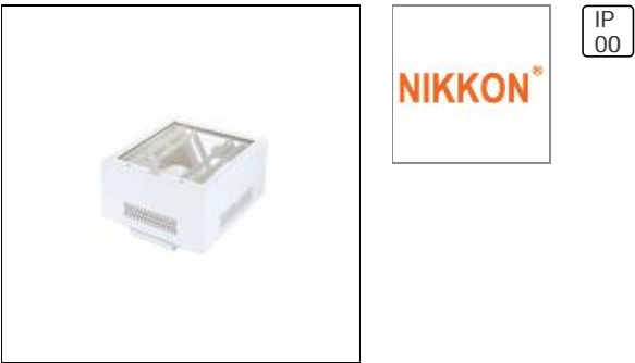
NIKKON NL150 SMS H0125 Lowbay c/w HPMV 125W Bulb Lamp

H0125 HPMV 125W BULB LAMP NL150SMS NIKKON