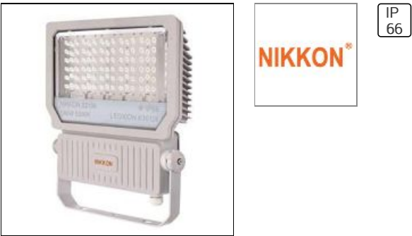
NIKKON S2190 LEDXION K10126 190W LED Floodlight (WB) (5000K)

190W LED FLOODLIGHT (WB) (5000K) S2190 LEDXION K10126 NIKKON