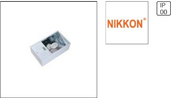
NIKKON NL150 SMR H0080 c/w HPMV 80W Bulb Lamp

H0080 HPMV 80W BULB LAMP NL150SMR NIKKON