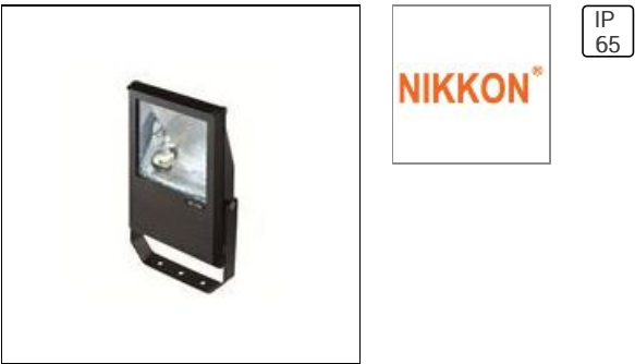
NIKKON S0701 S0070 Floodlight c/w HPS 70W Double Ended Lamp

S0070 HPS 70W DOUBLE ENDED LAMP S0701 NIKKON