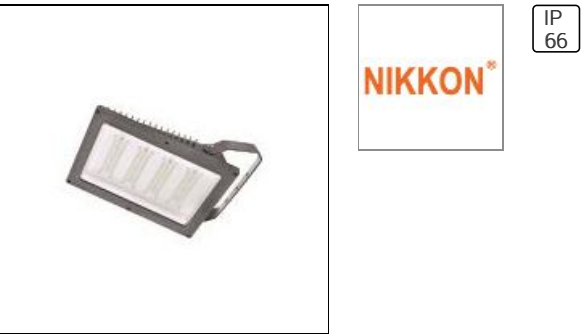
NIKKON LEDXION K10119 140W LED Floodlight (MB51) Type 4 (5000K)

140W LED FLOODLIGHT (MB51) TYPE 4 (5000K) S2266 LEDXION K10119 NIKKON