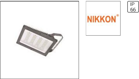
NIKKON S2266 LEDXION K10119 140W LED Floodlight (MB51) Type 4 (3000K)

140W LED FLOODLIGHT (MB51) TYPE 4 (3000K) S2266 LEDXION K10119 NIKKON