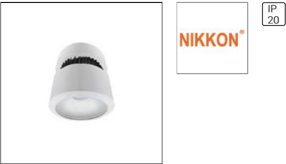
NIKKON BRONZO K01130 12.5W LED AC Cube Surface Downlight (3000K)

12.5W LED AC CUBE SURFACE DOWNLIGHT (3000K) BRONZO K01130 NIKKON