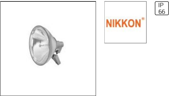
NIKKON S7019 M1000 Floodlight c/w MH 1000 Bulb Lamp