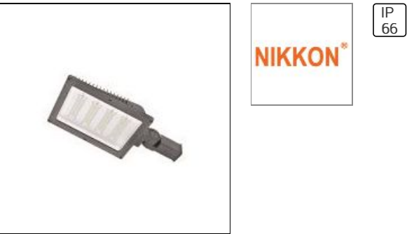
NIKKON S2266 LEDXION K10119 140W LED Floodlight (NB19) Type 2 (5000K)

140W LED FLOODLIGHT (NB19) TYPE 2 (5000K) S2266 LEDXION K10119 NIKKON