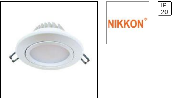
NIKKON LEDXION K01117 13W LED Downlight (5300K)

13W LED DOWNLIGHT (5300K) LEDXION K01117 NIKKON