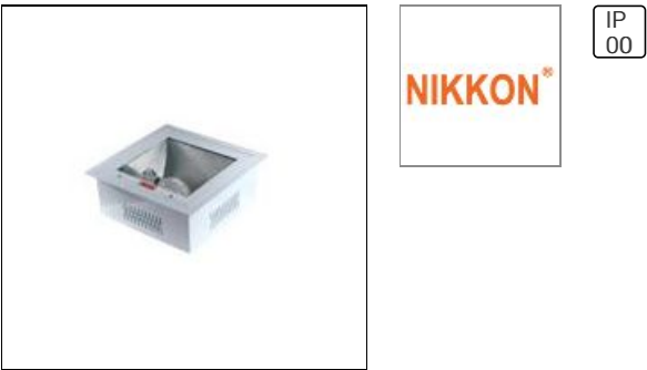
NIKKON NL150 RMS H0080 Lowbay c/w HPMV 80W Bulb Lamp

H0080 HPMV 80W BULB LAMP NL150RMS NIKKON