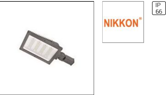
NIKKON S2266 LEDXION K10119 140W LED Floodlight (NB19) Type 2 (3000K)

140W LED FLOODLIGHT (NB19) TYPE 2 (3000K) S2266 LEDXION K10119 NIKKON