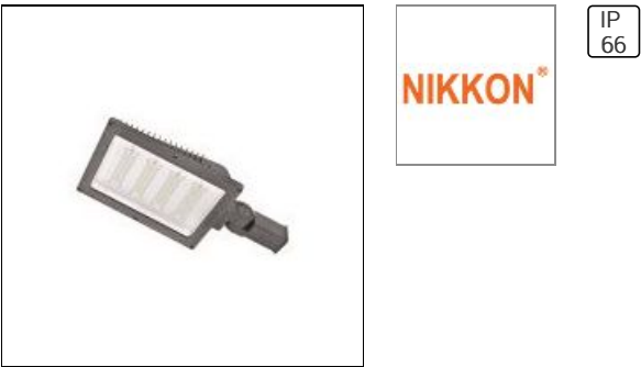
NIKKON S2266 LEDXION K10119 140W LED Floodlight (WB) Type 2 (5000K)

140W LED FLOODLIGHT (WB) TYPE 2 (5000K) S2266 LEDXION K10119 NIKKON