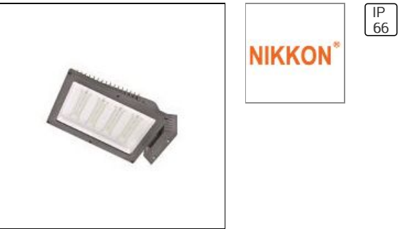
NIKKON S2266 LEDXION K10119 140W LED Floodlight (NB19) Type 3 (3000K)

140W LED FLOODLIGHT (NB19) TYPE 3 (3000K) S2266 LEDXION K10119 NIKKON