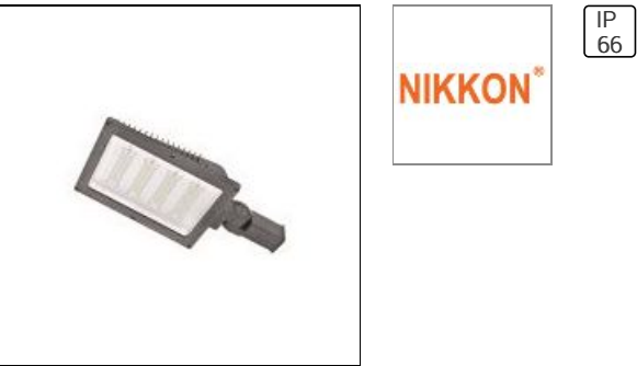
NIKKON S2266 LEDXION K10119 230W LED Floodlight (NB19) Type 2 (3000K)

230W LED FLOODLIGHT (NB19) TYPE 2 (3000K) S2266 LEDXION K10119 NIKKON