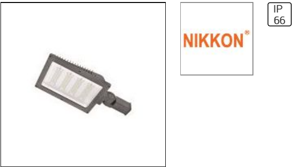
NIKKON S2266 LEDXION K10119 230W LED Floodlight (NB19) Type 2 (5000K)

230W LED FLOODLIGHT (NB19) TYPE 2 (5000K) S2266 LEDXION K10119 NIKKON